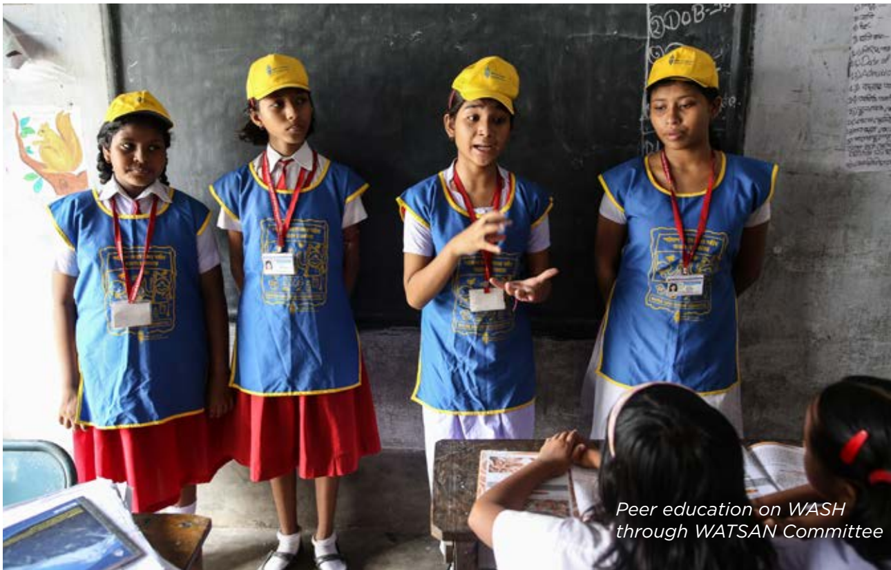
Peer education on WASH through WATSAN Committee