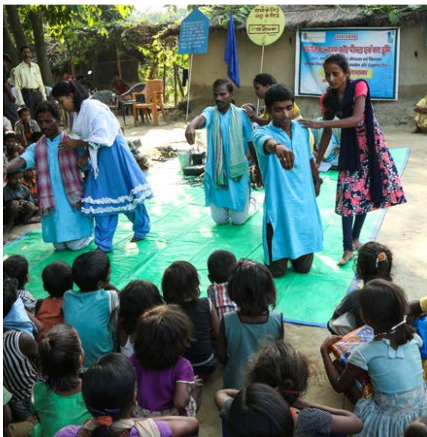
Awareness generation on WASH through street theatre and MDS in community