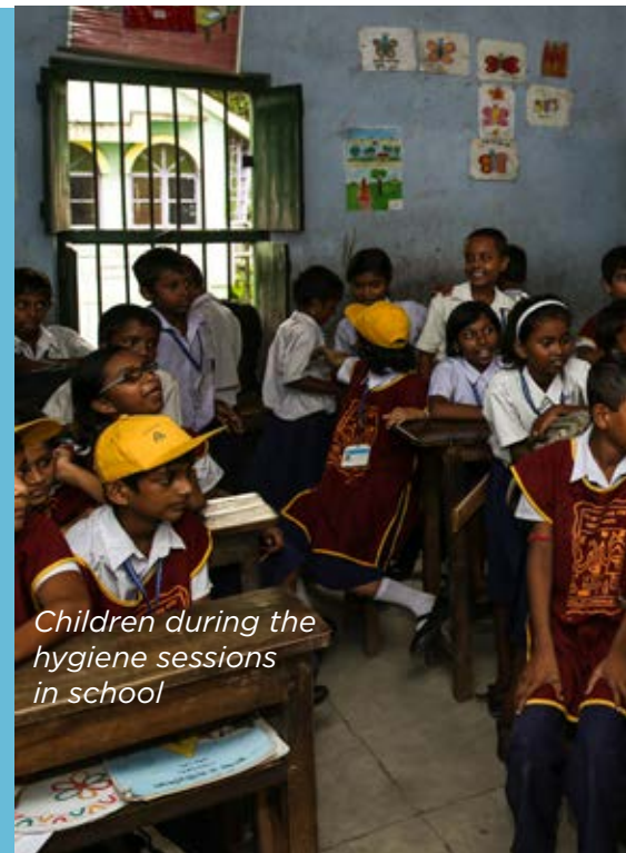
Children during the hygiene sessions in school